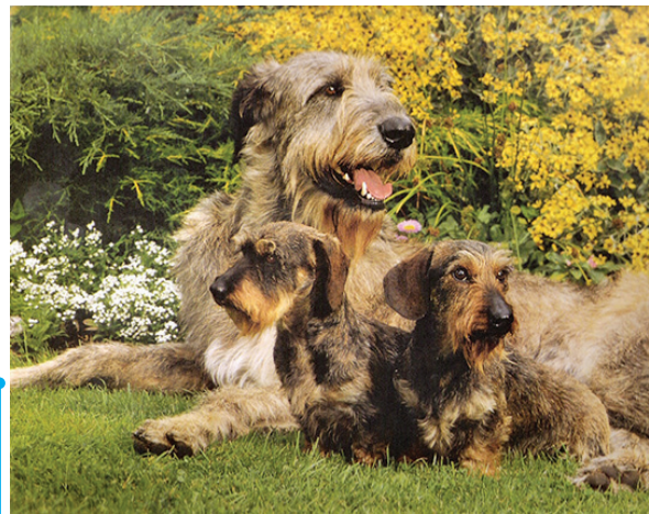
Wolfhound pic is Ch Tanat Trouble at Drakesleat, Ch/Am Ch Drakesleat Hobs Tickle, & Freemason

She is also the only judge in the UK approved to award Challenge Certificates in all breeds .