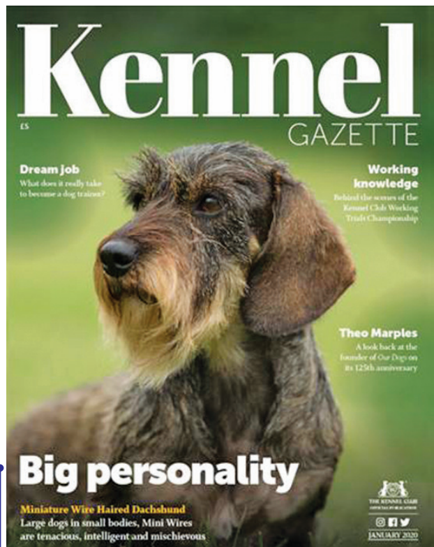
Mini Wire Dachshund on the Kennel Club Gazette cover: CH Drakesleat Scent Sybil - former breed record holder