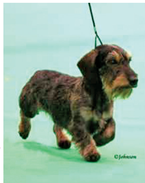
The dog moving is former breed record holder Ch Drakesleat Win Alot.